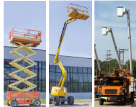
A scissor lift (left), a cherry picker (middle), and a bucket truck (right).

An aerial lift can prevent falls and reduce the risks for back, neck and shoulder injuries caused by working at or above shoulder level by positioning you where you need to work.